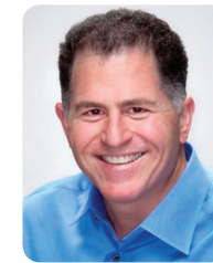
Michael Dell Chairman and Chief Executive Officer Dell Inc.