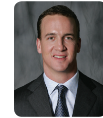
Peyton Manning NFL Quarterback Denver Broncos Corporate Supporter: vmware